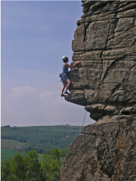
Photo: Meet leader in classic pose on Chequers Buttress.